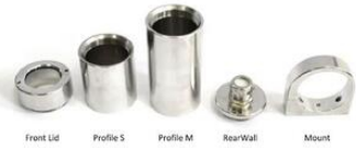
Front Lid Profile S Profile M Rear Wall Mount