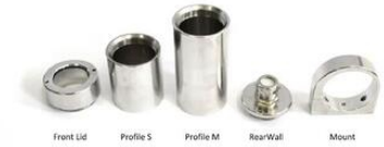
Front Lid Profile S Profile M Rear Wall Mount