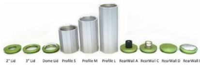
Order Numbers (please specify the camera type for each order!):