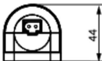
View of screw fixing