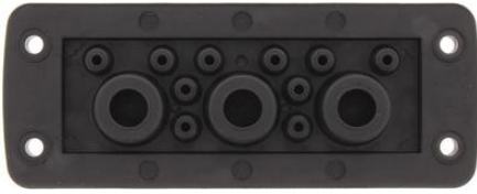
KES 13/24 10x Ø13.2 - 6.3mm 3x Ø16 - 26.5mm