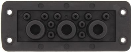
KES 13/24 10x Ø12 - 6.3mm 3x Ø16 - 26.5mm